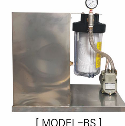
[ MODEL-BS ]